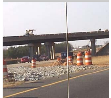
US 70 construction in Johnston County

Comprehensive Transportation Plan and endorsement of Johnston County's portion of the North Carolina Mountain-to-Sea Trail. This trail will serve bicyclists and pedestrians.