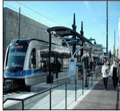
Recently opened Lynx line in Charlotte. Transit and transit investments are becoming significant topics of discussion within North Carolina's urban areas.