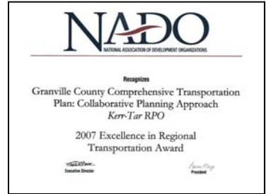
Granville County's National Association of Development Organizations Award for the CTP.

for inter-jurisdictional cooperation and planning and replaces the previously used thoroughfare plans. This Statute also established the MPO CTP as the only transportation plan recognized and endorsed by NCDOT. Granville County received the National Association of Development Organizations 2007 Award for the process used in creating the Granville County CTP.