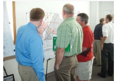
Participants in one of Granville County's CTP meetings.