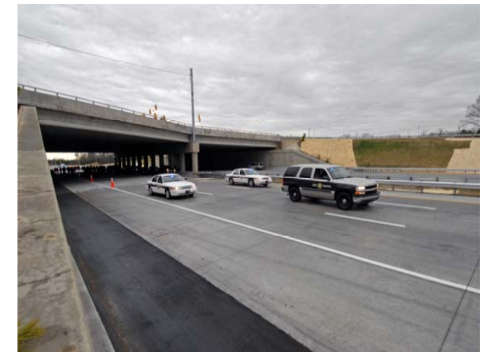
Dedication of I-540 in January 2007.