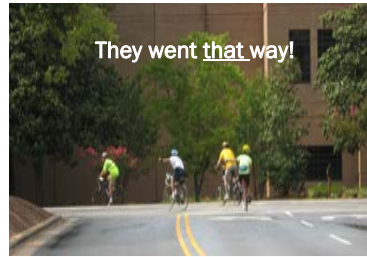
They went that way!